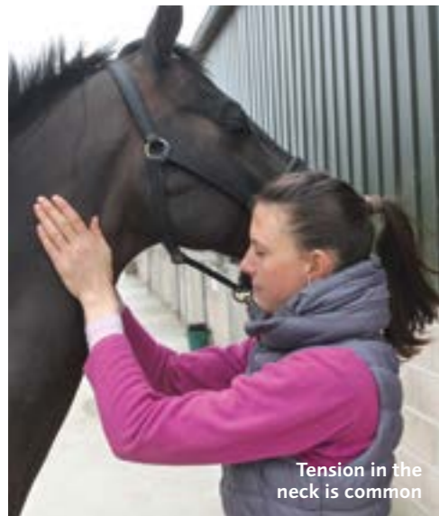
Tension in the neck is common

"With the pelvis, there are two things that can occur: it can rotate, where effectively one leg becomes slightly shorter than the other, and it can tilt, causing one limb to track up more than the other. His muscles are also tight in this area."