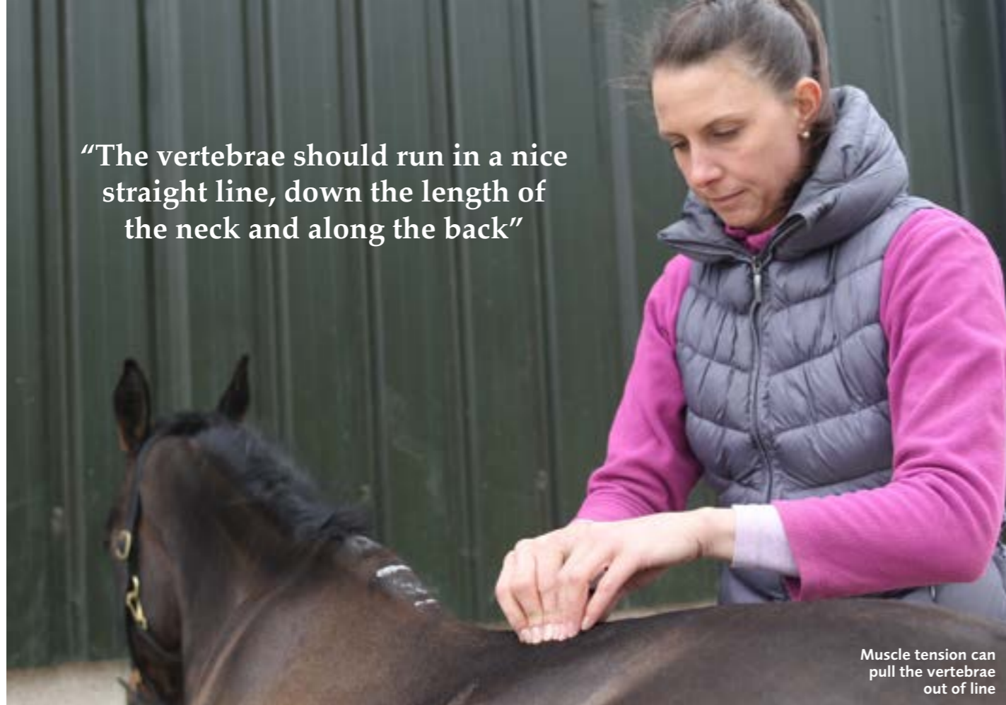
Muscle tension can pull the vertebrae out of line

“The vertebrae should run in a nice straight line, down the length of the neck and along the back”