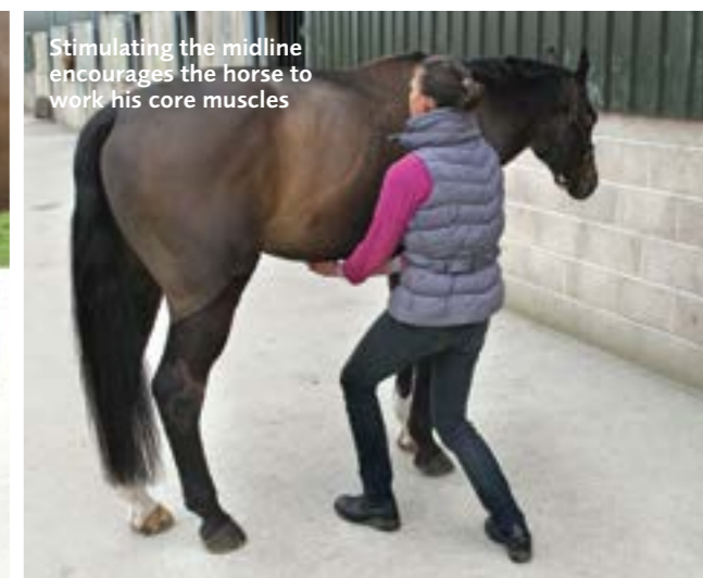
Stimulating the midline encourages the horse to work his core muscles